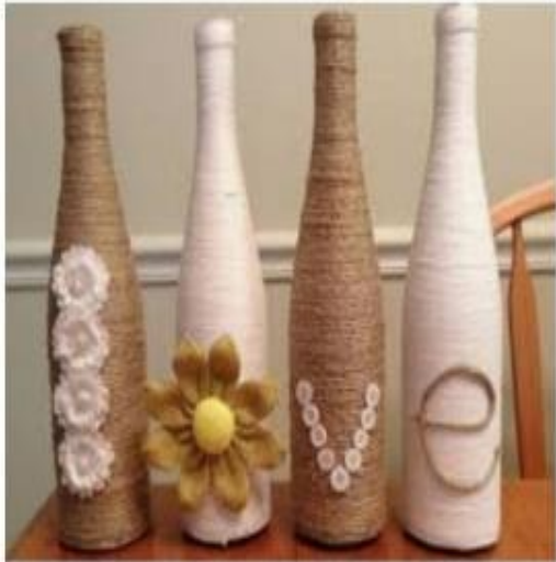
Pin on Crafts pinterest.com